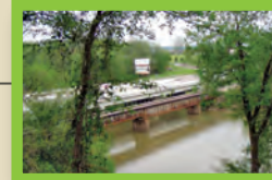
Little River Watershed Assoc.